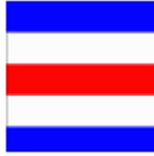
Change Course (C) Flag