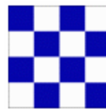
Abandon (N) Flag