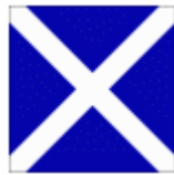
Missing Mark (M) Flag

(b) substitute one of similar appearance, or a buoy or vessel displaying flag M with repetitive sounds.