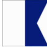
All Classes (A) Flag

NOTE: Since all classes start and race together in all OPCYC-run Club Races, the class flag for all OPCYC club races will be flag "A" for "All," like this: