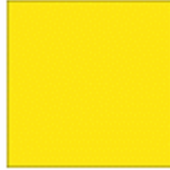
Scoring Penalty (Q) Flag

(a) A boat takes a Scoring Penalty by displaying a yellow flag at the first reasonable opportunity after the incident.