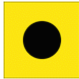
Round the Ends (I) Flag

If flag I has been displayed, and any part of a boat's hull, crew or equipment is on the course side of the starting line or its extensions during the minute before her signal, she shall thereafter sail from the course side across an extension to the pre-start side before starting .