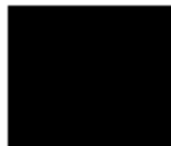
Hard Start: Disqualification Flag

If a black flag has been displayed, no part of a boat's hull, crew or equipment shall be in the triangle formed by the ends of the starting line and the first mark during the minute before her starting signal. If a boat breaks this rule and is identified, she shall be disqualified without a hearing, even if the race is restarted, resailed or rescheduled, but not if it is postponed or abandoned before the starting signal.