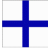
Individual Recall (X) Flag

When at a boat's starting signal any part of her hull, crew or equipment is on the course side of the starting line or she must comply with rule 30.1, the race committee shall promptly display flag X with one sound.