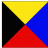
20% Scoring Penalty (Z) Flag

If flag Z has been displayed, no part of a boat's hull, crew, or equipment shall be in the triangle formed by the ends of the starting line and the first mark during the minute before her starting signal. If a boat breaks this rule and is identified, she shall receive, without a hearing, a 20% scoring penalty calculated as stated in rule 44.3(c). She shall be penalized even if the race is restarted, resailed or rescheduled, but not if it is postponed or abandoned before the starting signal. If she is similarly identified during a subsequent attempt to start the same race, she shall receive an additional 20% Scoring Penalty.