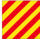
Life Jacket (Y) Flag

When flag Y is displayed with one sound before or with the warning signal, competitors shall wear personal flotation devices, except briefly while changing or adjusting clothing or personal equipment. Wet suits and dry suits are not personal flotation devices.