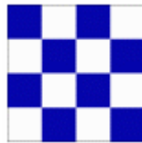
Abandon (N) Flag

32.1 After the starting signal, the race committee may abandon the race (display flag N, N over H, or N over A, with three sounds) or shorten the course (display flag S with two sounds), as appropriate,